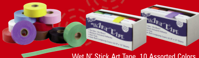
Wet N' Stick Art Tape, 10 Assorted Colors

Favorite Pacon® products included in this project: